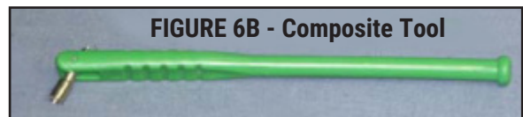
FIGURE 6B - Composite Tool