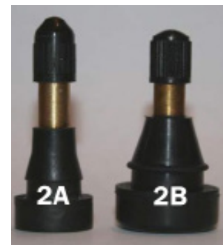
FIGURE 2A: Rated Max 80 psi FIGURE 2B: Rated Max 100 psi