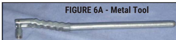
FIGURE 6A - Metal Tool

Use an appropriate installation tool to install the snap-in valve into the rim hole until the indicator ring (as noted in Figure 5) clears the weather side of the rim. Figures 6A and 6B shows both a metal and a composite installation tool.