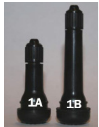
FIGURE 1A and 1B: Rated Max 65 psi

All of the valves in Figures 1, 2 and 3 are commonly available for both standard wheel valve holes (0.453-in/11.51 mm) and larger wheel valve holes (0.625-in/15.88 mm).