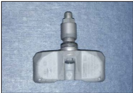
FIGURE 4C: Clamp-in TPMS Valve