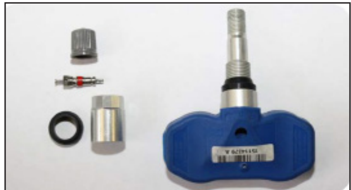
FIGURE 4D: TPMS Replacement Kit with Valve Assembly