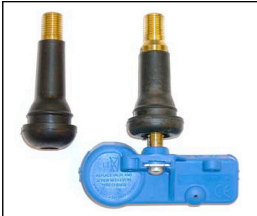
FIGURE 4A: Comparing Standard Snap-In Valve to a TPMS Snap-In Valve with Sensor