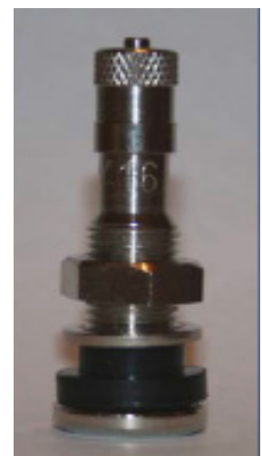
FIGURE 3: Rated Max 200 psi