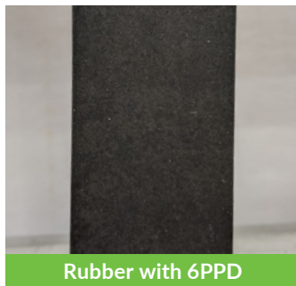
Rubber with 6PPD

6PPD is an antioxidant and antiozonant that helps prevent the degradation and cracking of rubber compounds caused by exposure to oxygen, ozone and temperature fluctuation.