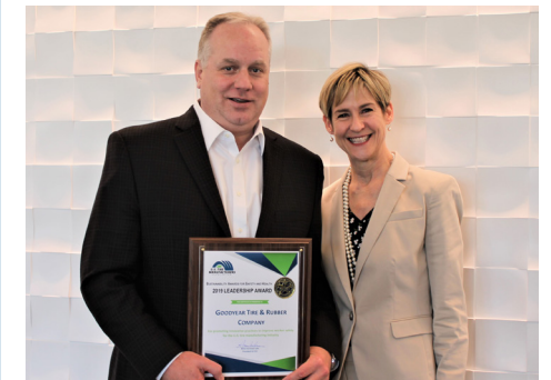
USTMA's annual awards highlight and promote safety innovations and best practices