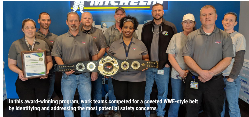
In this award-winning program, work teams competed for a coveted WWE-style belt by identifying and addressing the most potential safety concerns

facility record a 7% year-to-year improvement in ergonomic-related injuries.