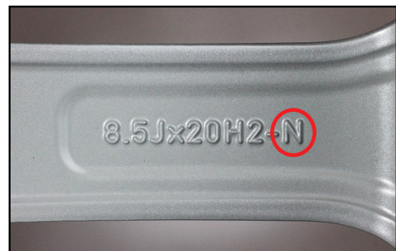
FIGURE 2: Example Marking for a J-N Rim Contour